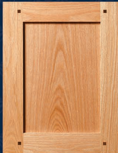
Helsingborg #6638 (Red Oak) w/ Walnut Square Peg Inserts OV-3 Edge