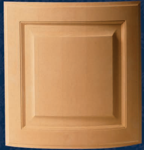
-1210S MDF - Convex Door OV-1 Edge