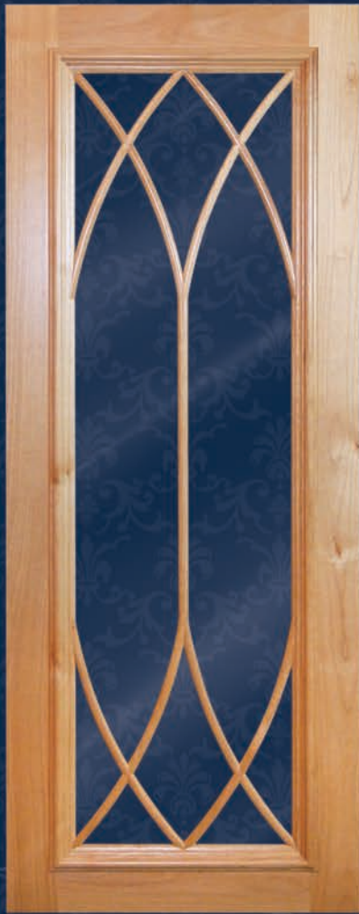
-Bronderslev with Gothic Arch Mullions

The Bronderslev with Gothic Arch Mullions french lite you see below came to be from one of our clients creative ideas. We have the capabilities, we just need your inspiration.