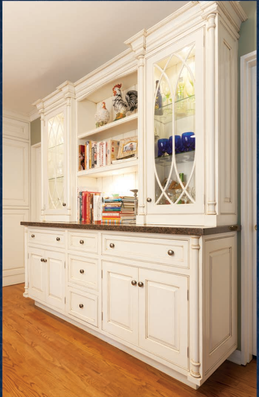
-Corleone #71 (Paint Grade) OV-3 Edge Buffet cabinet uppers with Gothic Arch Mullions