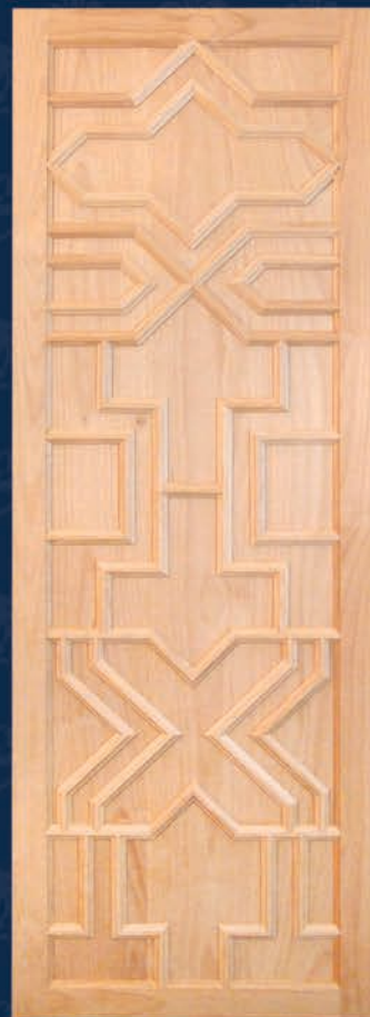
Ashton with special plant on mullions over plywood