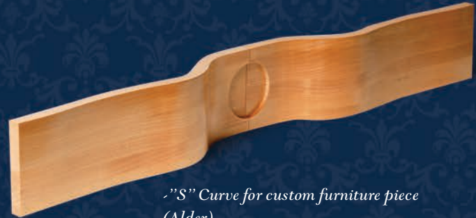
·"S" Curve for custom furniture piece (Alder)