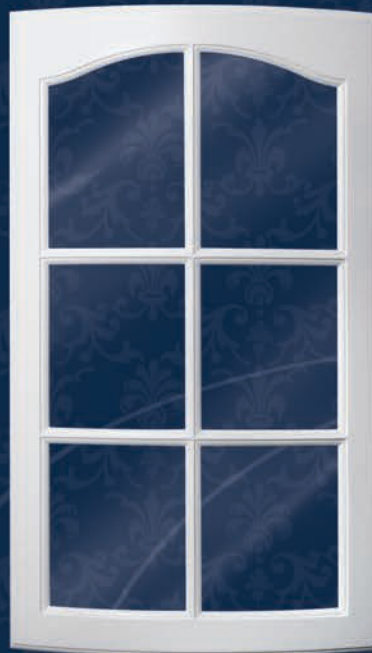
-1430 - Convex 6 Lite Glass MDF (Painted White) OV-13 Edge