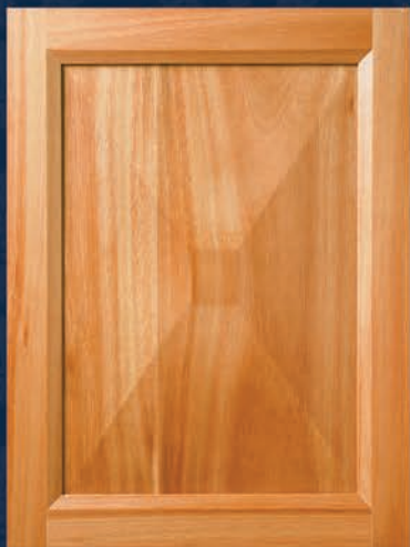
-Custom Pyramid Panel Door (Lyptus) OV-3 Edge