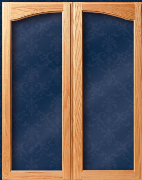
French Pair Glass (Red Oak) OV-1 Edge