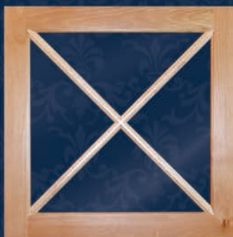
Liverpool with 4 lite diagonal mullions