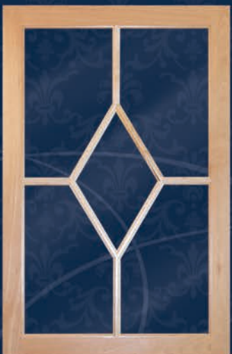
Corleone with 5 lite center diamond