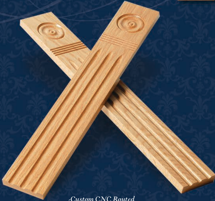
-Custom CNC Routed Fluting with Rosettes (Red Oak)