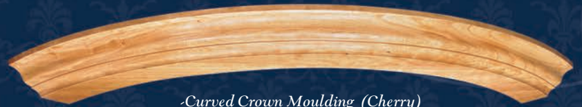
·Curved Crown Moulding (Cherry)