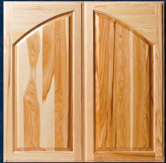
-French Pair with Special Arch (Hickory|Pecan) OV-1 Edge