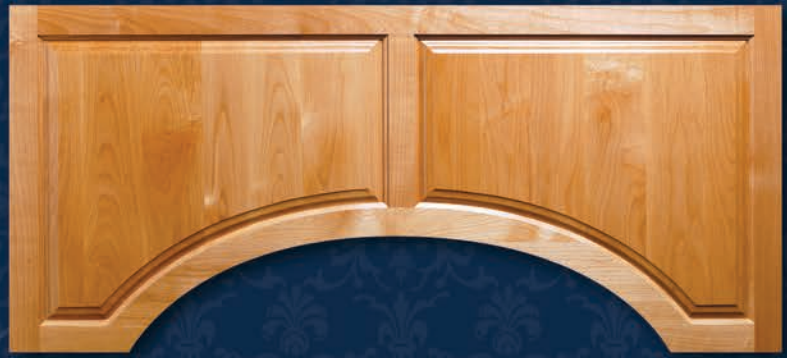
-Custom Valance with Nottingham #23 Details (Alder) OV-3 Edge