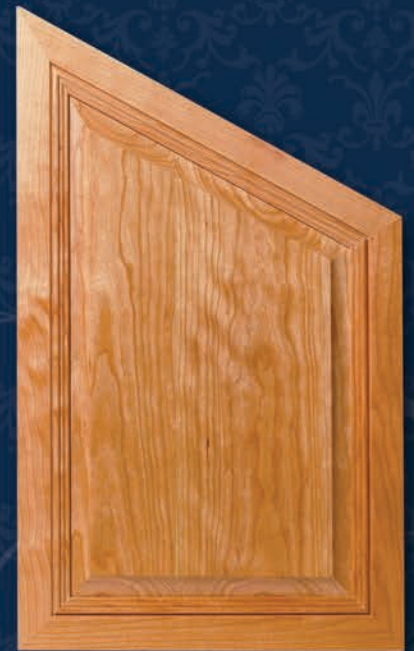
-Verona #50 Angle Door (Cherry) OV-3 Edge