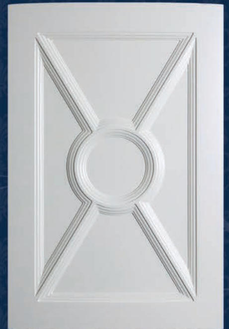
-Custom Convex X-Ring Recessed MDF (Painted White) OV-3 Edge