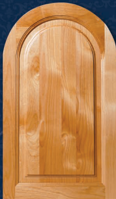
-Malaga #79 (Alder) with Special 1/2 Circle Arch OV-3 Edge