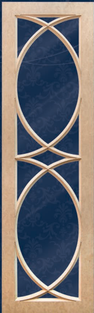
One Piece 1610 (shown in MDF) with custom 13 lite design