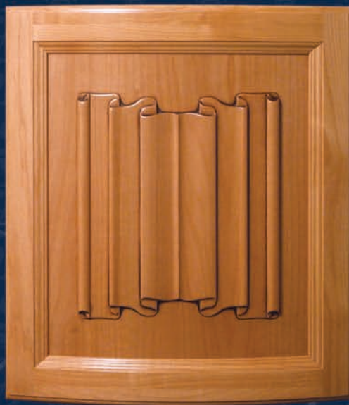
·Convex Malaga Frame with special Linen Panel (Alder)