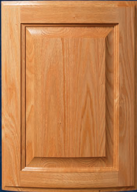
·Liverpool #1 · Convex Door (Red Oak) ·LN101 Drawerfront OV-1 Edge