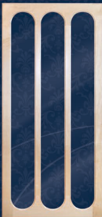
3 Lite Mullion Configuration w/ full 180 radius arches