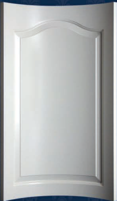
-1430 - Concave MDF (Painted White) OV-3 Edge