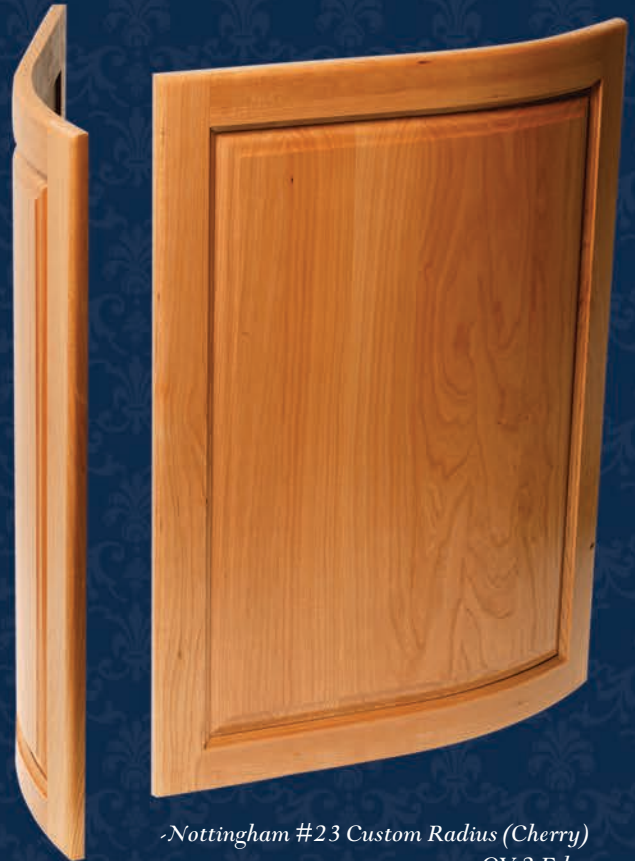
·Nottingham #23 Custom Radius (Cherry) OV-2 Edge

Here is an example of our unique option of creating a radius curve forming out of a straight edge.