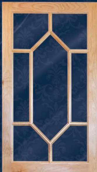
Liverpool with 7 lite center emerald