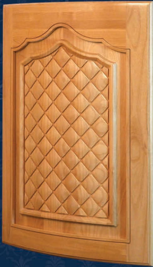
-Convex Door with custom arch and custom French Diamond Panel (Alder)