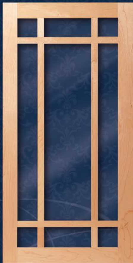
Copenhagen #3638 Custom French Lite (Maple) OV-3 Edge